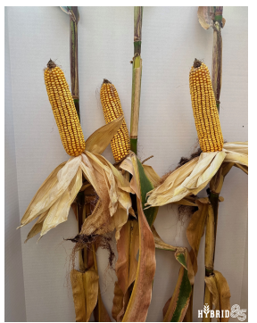
Nebraska Test Plot - Fall 2024