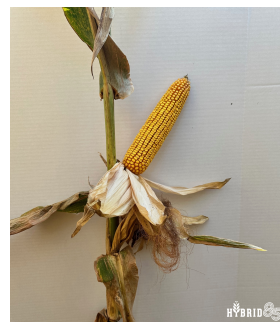
Nebraska Test Plot - Fall 2024