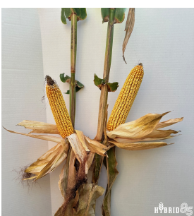
Nebraska Test Plot - Fall 2024